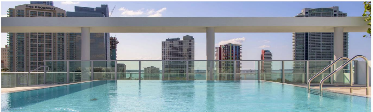
The pool and sun deck at the Atton Brickell Miami overlooks the city.