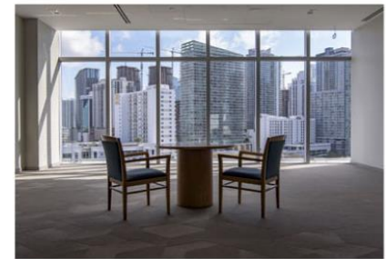
The view from one of the meeting spaces at the Atton Brickell Miami. The hotel features 6,000 square feet of event and meeting space.